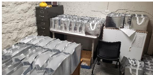
Winter Fun Activity Bags ready to be filled!